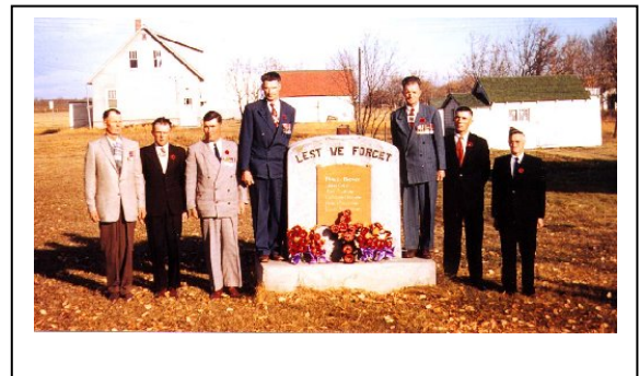
Kingman War Memorial

Not one corner of a foreign field But a span as wide as Europe; An appearance of a Titan's grave, And the length thereof a thousand miles. It crossed all Europe like a mystic road, Or as the Spirits' Pathway lieth on the night. And I heard a voice crying, This is the Path of Glory.