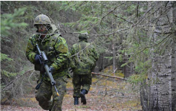
Soldiers from 41 Service Battalion secure the perimeter of their Commodity Point location during Exercise WILD MUSTANG held at Camp Worthington, west of Caroline, from 21 to 23 April 2017.