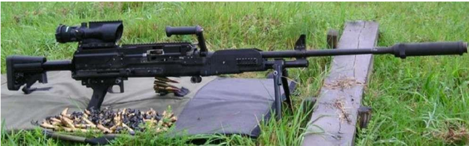
A General Dynamics LWMMG Prototype with suppressor

The belt-fed “lightweight medium machine gun” (LWMMG) is less than 24 pounds, have a barrel 24 inches long, and able to fire somewhere between 500 to 600 rounds per minute. Special operators and Marines want a weapon that is accurate against area targets, such as groups of individuals or vehicles, out to a range of more than 2,000 yards.