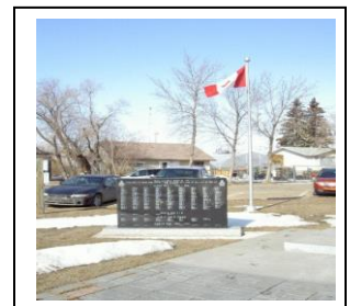
Barrhead War Memorial

Fearful eyes looked upwards at the thousands of arrows streaking across the sky, the sun playing its reflective rays on those deadly tips. The targets for those shafts of death held their wooden shields aloft as the prayers flowed freely from their lips. The lucky ones died instantly, wooden missiles smashing through their bodies, splintering bone, and piercing their racing hearts. Screams from the wounded, hard to ignore as the arrows stopped them playing their valiant parts. The vanquished were fearful of the expected slaughter, which they understood would be their fate. Victors hacked and slashed at their beaten foe, spilling their blood, just to satisfy their hate.