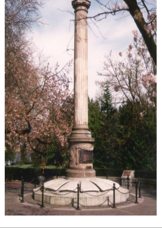
WWI Japanese War Memorial

The glitter of garland round their head. Theirs is the hollow victory. They are deceived. But you my brother and my ghost, if you can go Knowing that there is no reward, no certain use In all your sacrifice, then honour is reprieved. To fight without hope is to fight with grace, The self reconstructed, the false heart repaired.' Then I turned with a smile, and he answered my salute As he stood against the fretted hedge, which was like white lace.