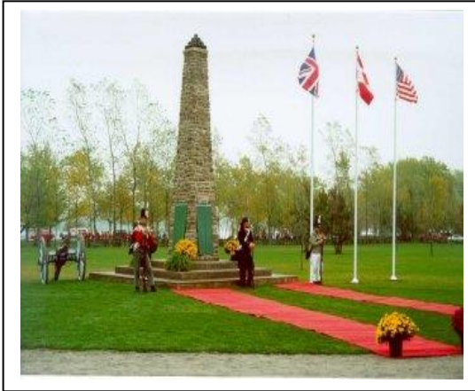
Chippawa Battlefield Memorial

God of my fathers! guide my way Amidst the Battle's fierce alarms; Grant me to see, this dreadful day, The triumph of my Country's arms. Yet not my will, but thine be done, If thy high wisdom doom my fall, Tho' short the race of life I've run, I die content at Duty's call. Then, if thy grace my prayer accord, Th' expression of my parting breath, Grateful, I'll bless thy goodness, Lord! And smile amidst the pangs of Death. "May my transgressions of thy will Find mercy thro' my Saviour's name! May my lov'd Country, freed from ill, Long flourish in unbounded fame!"