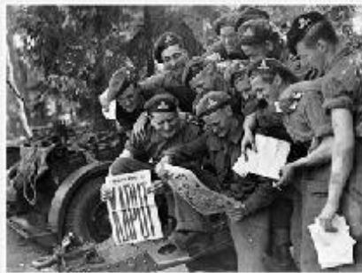
An Officer in the Headquarters of the 10th Field Artillery Bde. shows the location of the Maastricht