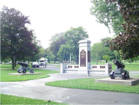
The Royal Canadian Horse Artillery Memorial

THERE'S a breathless hush in the Close to-night Ten to make and the match to win A bumping pitch and a blinding light, An hour to play and the last man in. And it's not for the sake of a ribboned coat, Or the selfish hope of a season's fame, But his Captain's hand on his shoulder smote "Play up! play up! and play the game!" The sand of the desert is sodden red, Red with the wreck of a square that broke; The Gatling's jammed and the colonel dead, And the regiment blind with dust and smoke. The river of death has brimmed his banks, And England's far, and Honour a name, But the voice of schoolboy rallies the ranks, "Play up! play up! and play the game!" This is the word that year by year